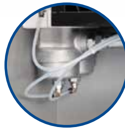
ON BOARD DUAL COMPRESSED AIR FILTRATION