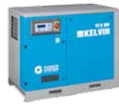
▲ KELVIN 11-10 DV