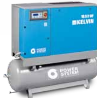
▲ KELVIN 18.5-10-500 DF