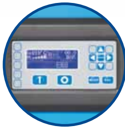
ADVANCED INTUITIVE CONTROL