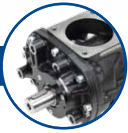
PREMIUM QUALITY COMPRESSOR AIR END