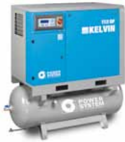
▲ KELVIN 11-10-270 DF