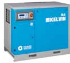
▲ KELVIN 15-10