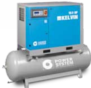
▲ KELVIN 15-10-500 DF