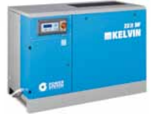
▲ KELVIN 22-10 DF

The KELVIN range is available in different versions, to satisfy every installation requirement: